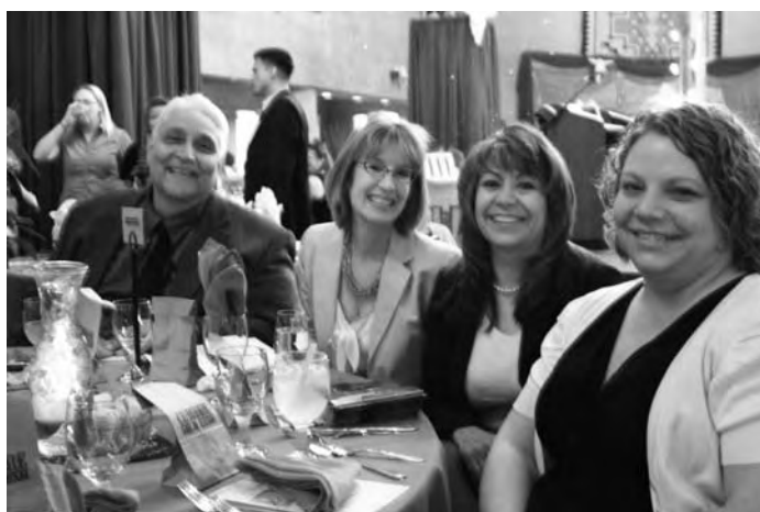
PART OF THE METH AWARENESS TASK FORCE AT THE NMPSA CUMBRE AWARDS