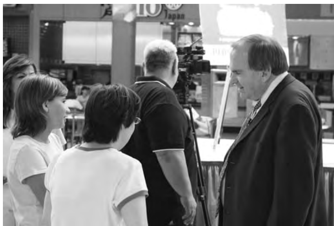
WEBWISE KIDS: PARENTS INTERNET SAFETY PROGRAM ROLL-OUT