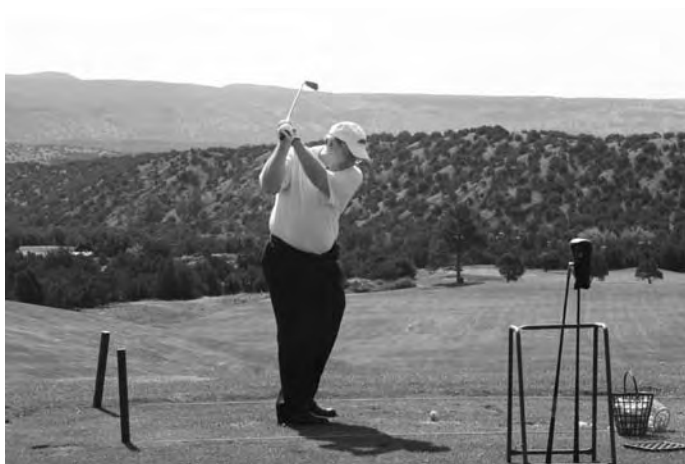
GOLF TOURNAMENT FUNDRAISER FOR THE SPECIAL OLYMPICS LAW ENFORCEMENT TORCH RUN