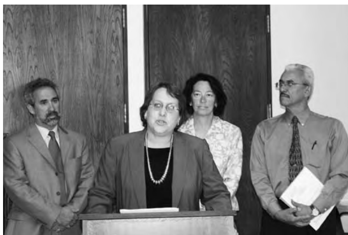
FORECLOSURE PRO BONO TRAINING