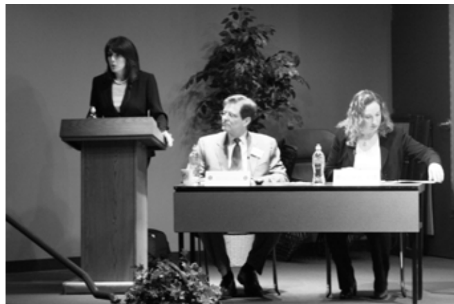
HUMAN TRAFFICKING TRAINING

BVD’s goals include presenting comprehensive educational trainings; providing investigative assistance to the task forces within their individual communities; and overall encouragement and support of related activities. The division is working to further develop a proactive law enforcement investigative capability for human trafficking and is seeking additional federal funding to support human trafficking efforts. BVD plans to increase services for extradition and/or foreign prosecution of wanted persons located in foreign countries, particularly Mexico. In addition, the division looks to increasingly address border-related policies and criminal justice reform with Mexican states.