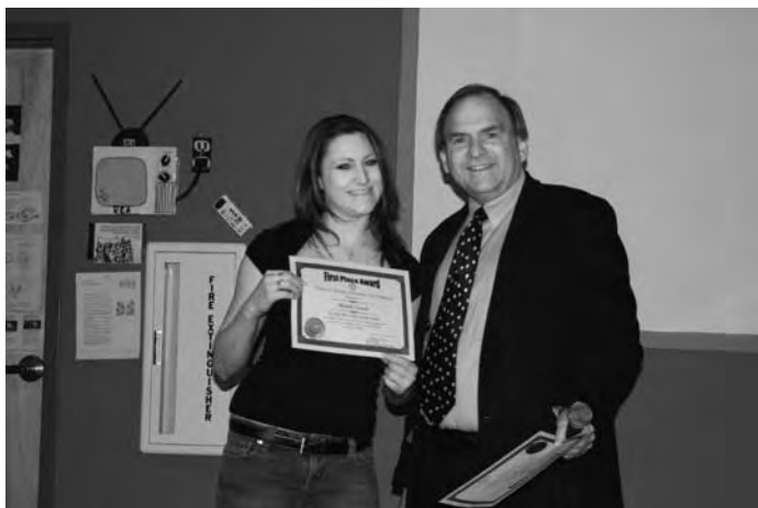
ALCOHOL AWARENESS VIDEO CHALLENGE AWARDS