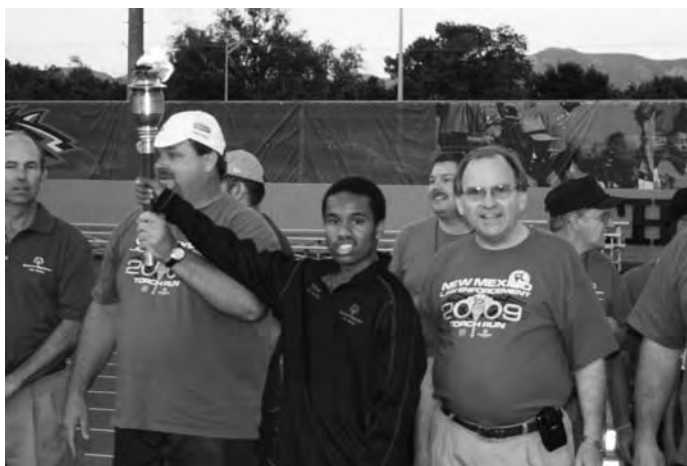
SPECIAL OLYMPICS LAW ENFORCEMENT TORCH RUN